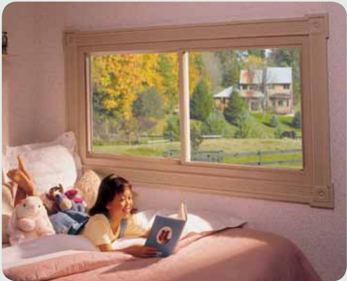
In a 2-Lite Slider one sash is fixed. In a 3-Lite Slider the two end sashes operate.

The Barrington LIMITED offers a broad selection of window styles for your choosing.