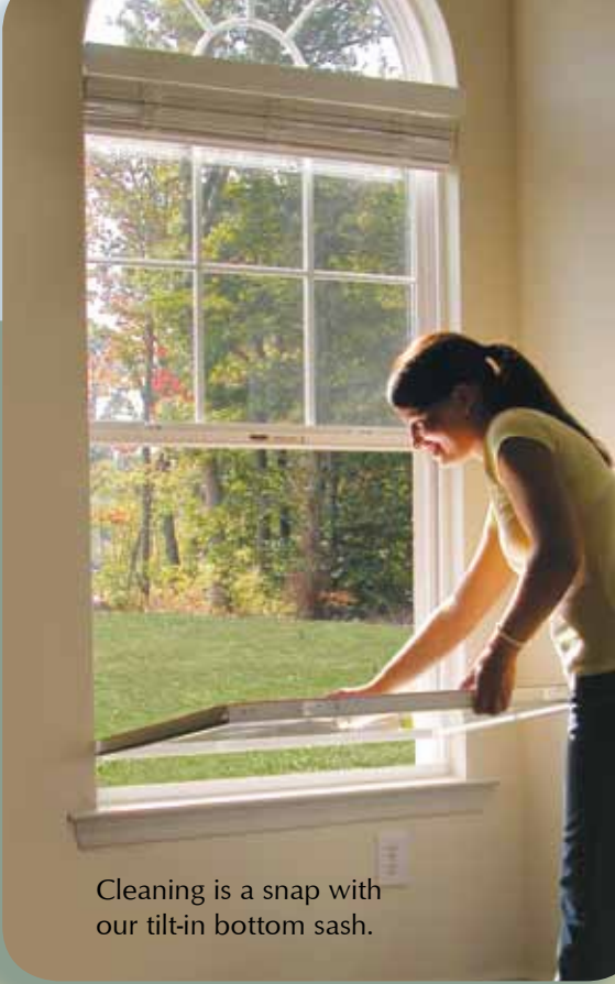
Cleaning is a snap with our tilt-in bottom sash.

Our snap-on, flexible nailing flange and J-Channel for new construction is available with unique welded corners.