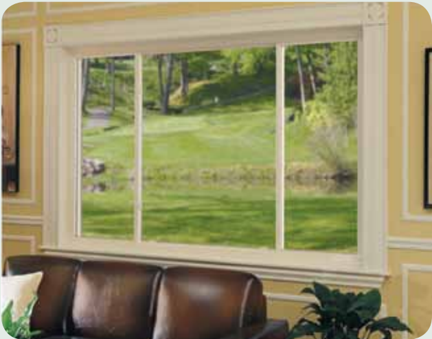
3-Lite Sliders are available in a 1/4-1/2-1/4 configuration as shown, or in a 1/3-1/3-1/3 configuration.