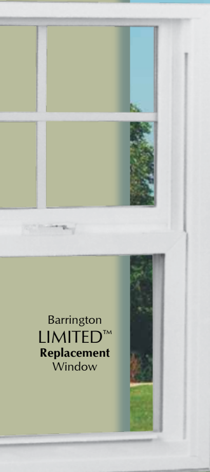
Barrington LIMITED™ Replacement Window